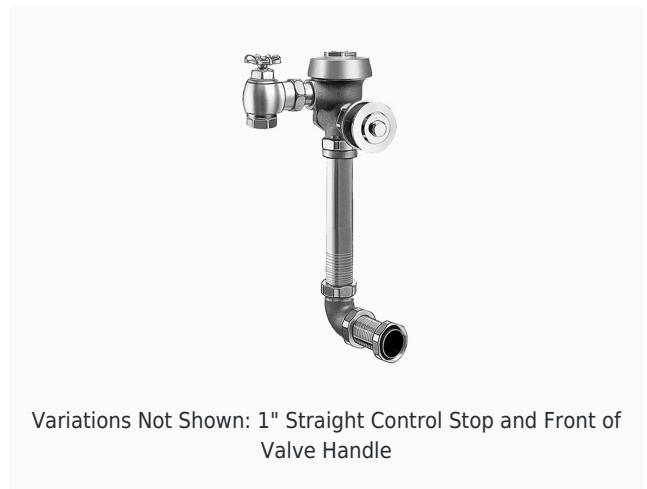
Variations Not Shown: 1" Straight Control Stop and Front of Valve Handle